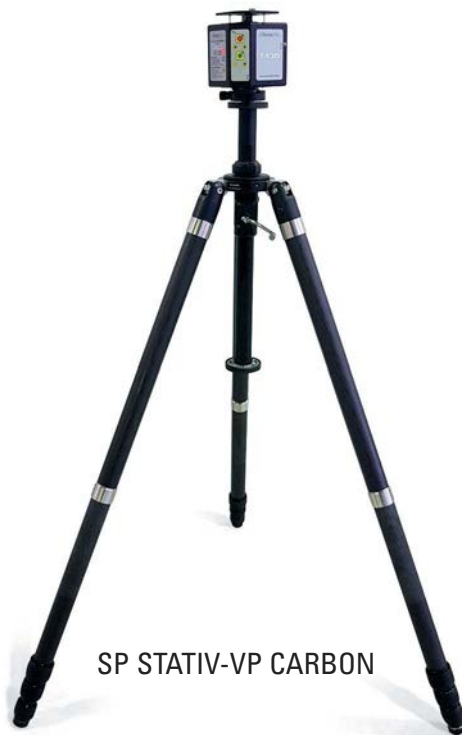
SP STATIV-VP CARBON