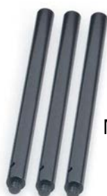
Mini Tripod Legs 200mm (BG 832263)