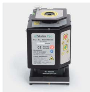
90° Adapter for T430 mounting (BG 832254) T430 Adapter for large L bracket Interface to BG 832254 (BG 832253)