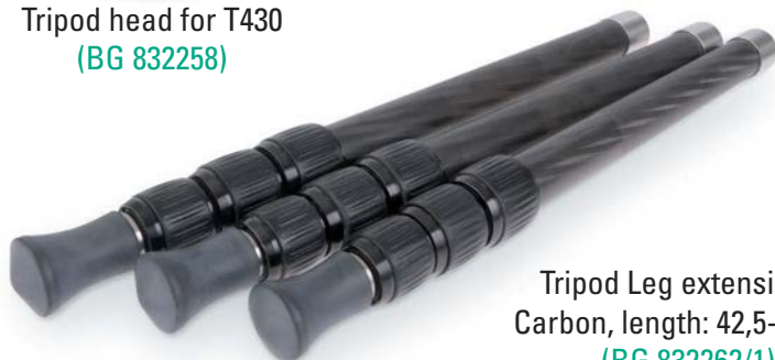
Tripod Leg extension in Carbon, length: 42,5-129 cm (BG 832262/1)