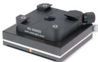
Switch Magnet Base for T430 Interface Plate BG_832251 (BG 832252)