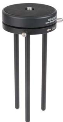
Short tripod extension (BG 832261)