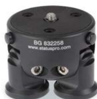
Tripod head for T430 (BG 832258)