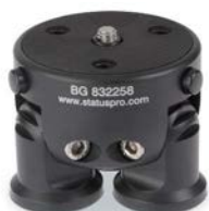
Tripod head for T430 (BG 832258)