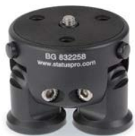
Tripod head for T430 (BG 832258)