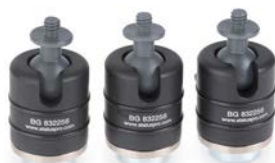
Mini Tripod Magnetic foot (BG 832256)