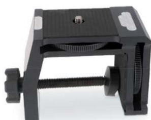
Universal G-Klump for T430 (BG 832255/1)