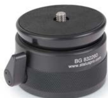
Tripod Gimbal head for T430 (BG 832260)