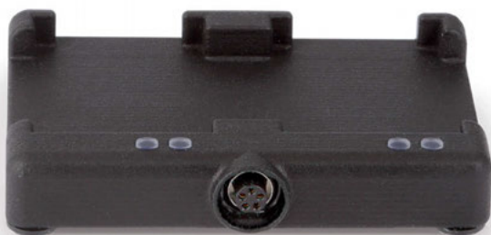
External battery charger